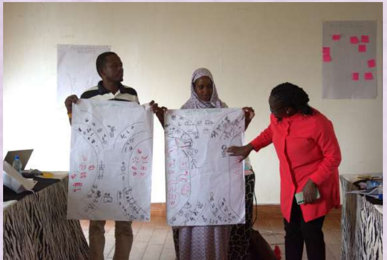
Interactive Training and Group Discussions in Isiolo