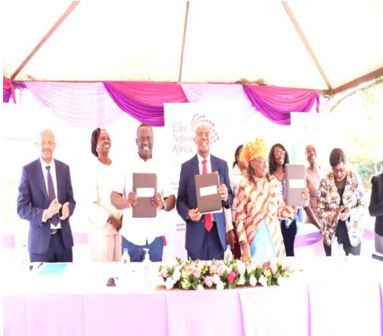
Jubilation galore after signing of the MOU between ENAF, Uraia Trust and Kenya Broadcasting Corporation - Channel 1

On Tuesday 30th July 2024, Echo Network Africa Foundation (ENAF) and the Democracy trust Fund (DTF), in collaboration with Uraia Trust and the Kenya Broadcasting Corporation (KBC), launched and signed a Memorandum of Understanding (MoU). This marked the commencement of the production and transmission of a series of 'Chagua Mama - Ni Tyme ya Mama' short documentaries/audio-visual podcasts which shall be produced and aired between July and December 2024.