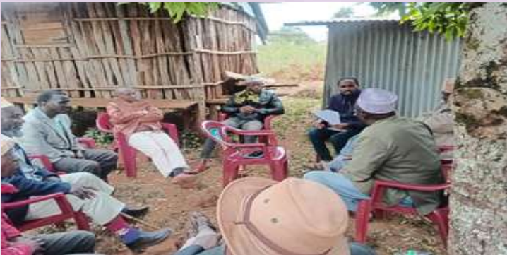
Above: Focus Group Discussions with both men and women, in Marsabit

Data collection for the Kuza Jamii Project in five (5) counties has drawn to a close. Twelve single Gender Focus Group Discussions were conducted across Mandera, Garissa, tana River, Isiolo and Marsabit Counties.