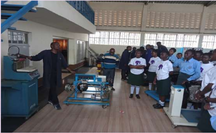
Women Scientists, Tech Professionals, Mathematicians & Engineers in the making!