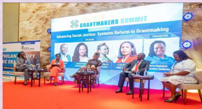
A panel of Development experts deliberating on matters grant making

The 2024 Grant Makers Summit was hosted in Nairobi by East Africa Philanthropy Network. The two-day convergence sought to: